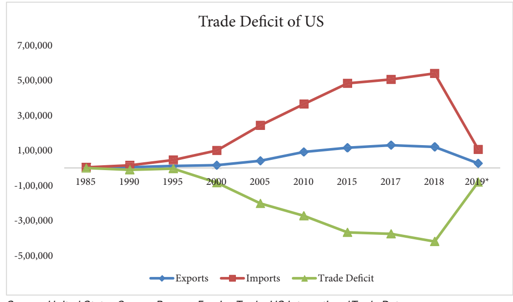
Chart 1. Exports of Goods, Imports of Goods, and Trade Deficit of the United States.